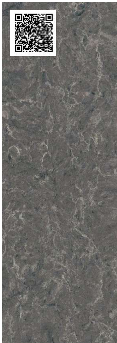
6003 Coastal Grey