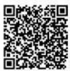
4011 Cloudburst Concrete