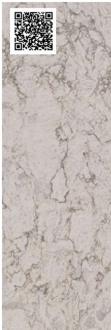
6046 Moorland Fog