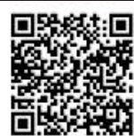
3100 Jet Black