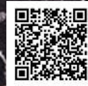
5100 Vanilla Noir