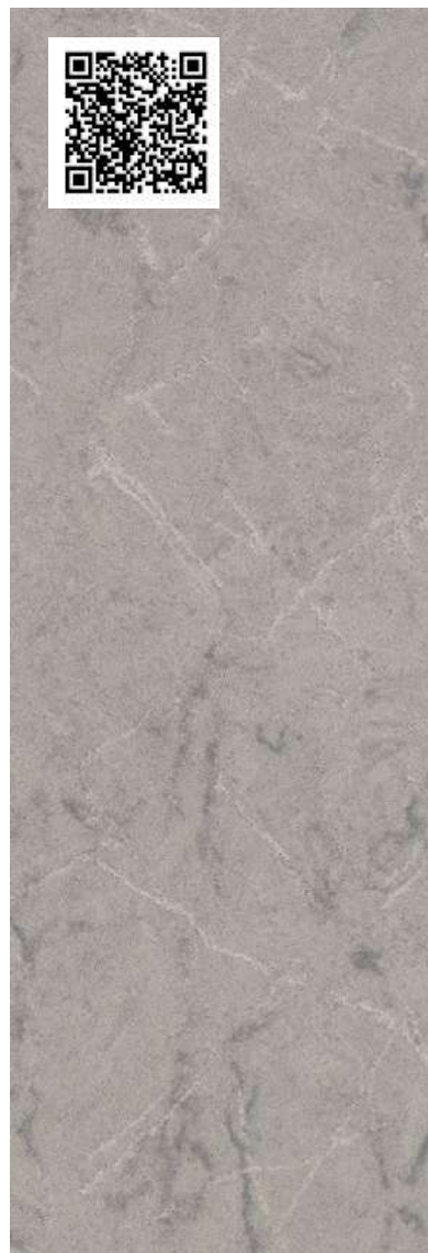
5133 Symphony Grey