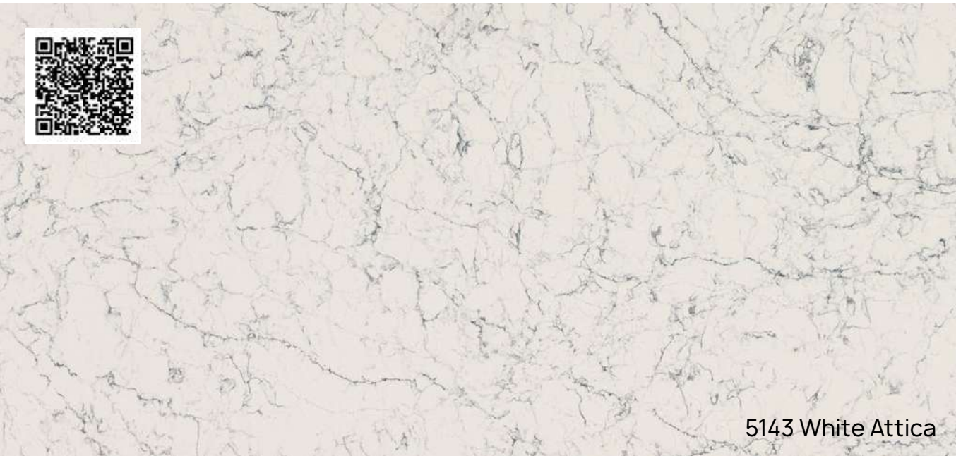
5143 White Attica