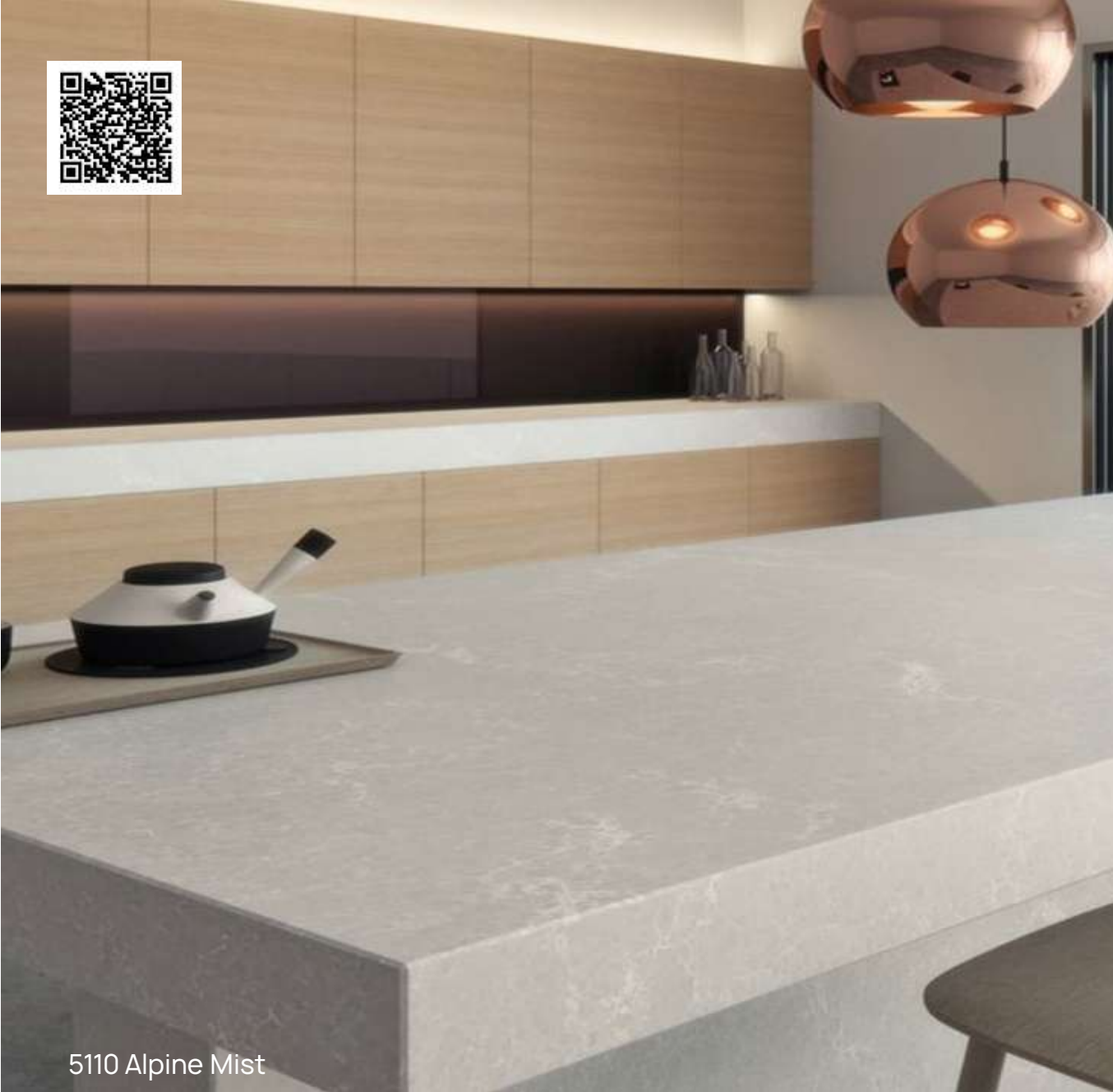
5110 Alpine Mist