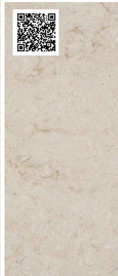
5212 Taj Royale