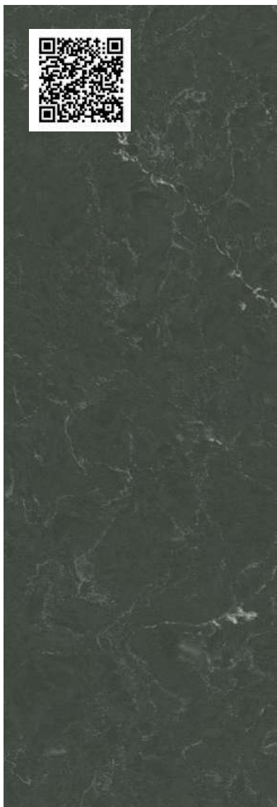
5003 Piatra Grey