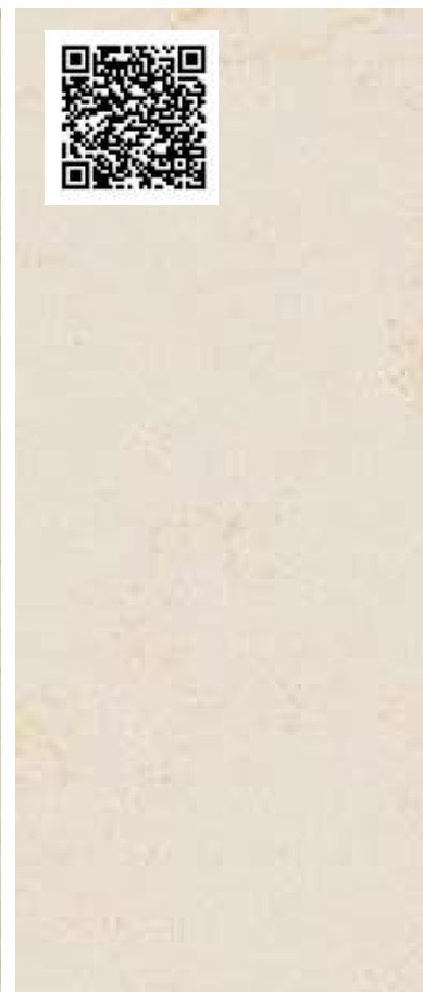
5220 Dreamy Marfil