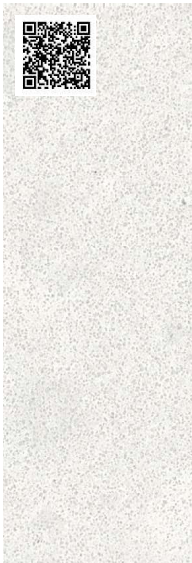
4600 Organic White