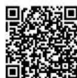
1141 Pure White