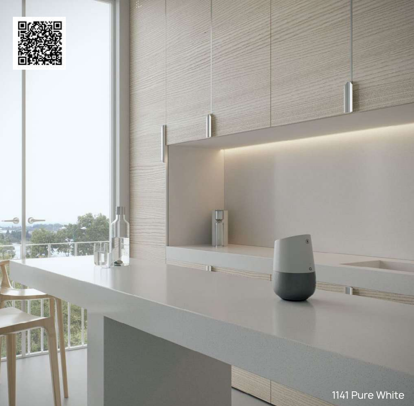
1141 Pure White