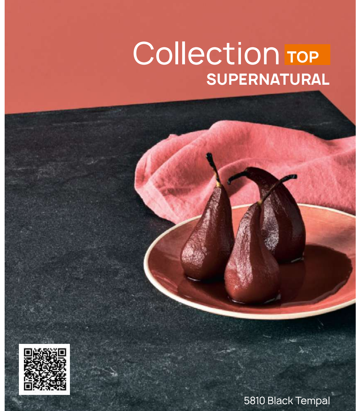
5810 Black Tempal